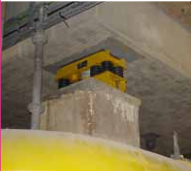
Retrofit of a Turbo Compressor Foundation, Germany