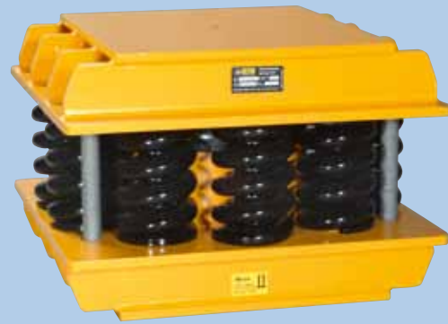
Typical GERB Spring Unit