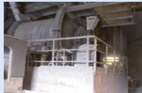
Retrofit of a Rod Mill, Germany