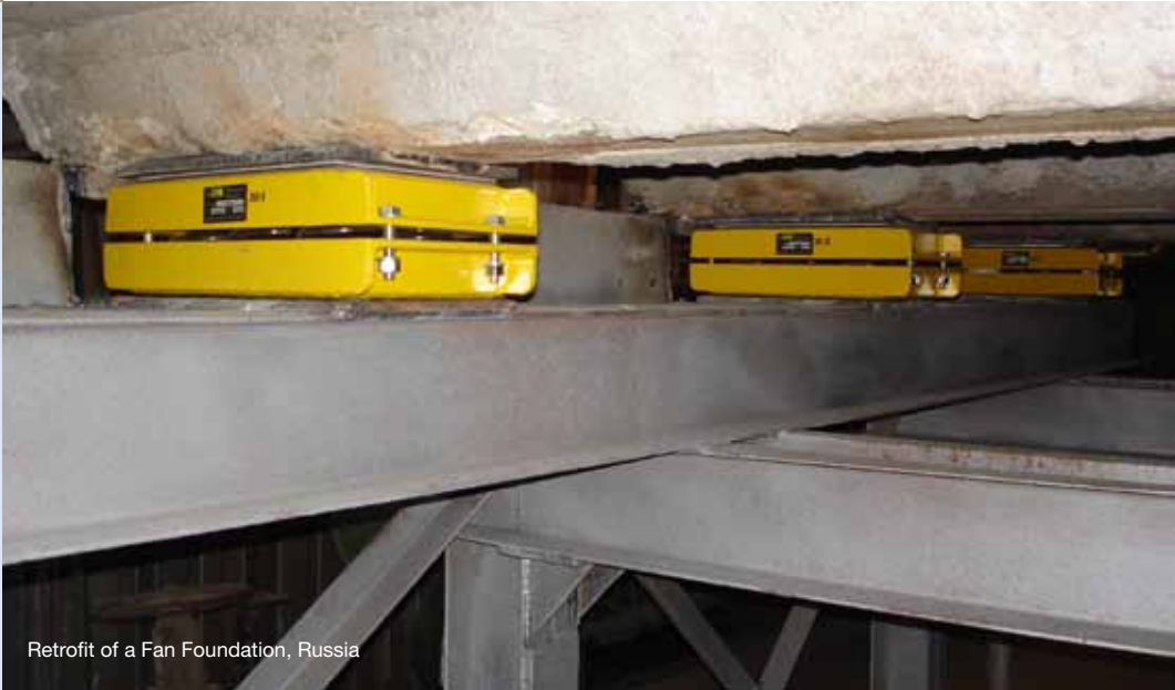
Retrofit of a Fan Foundation, Russia