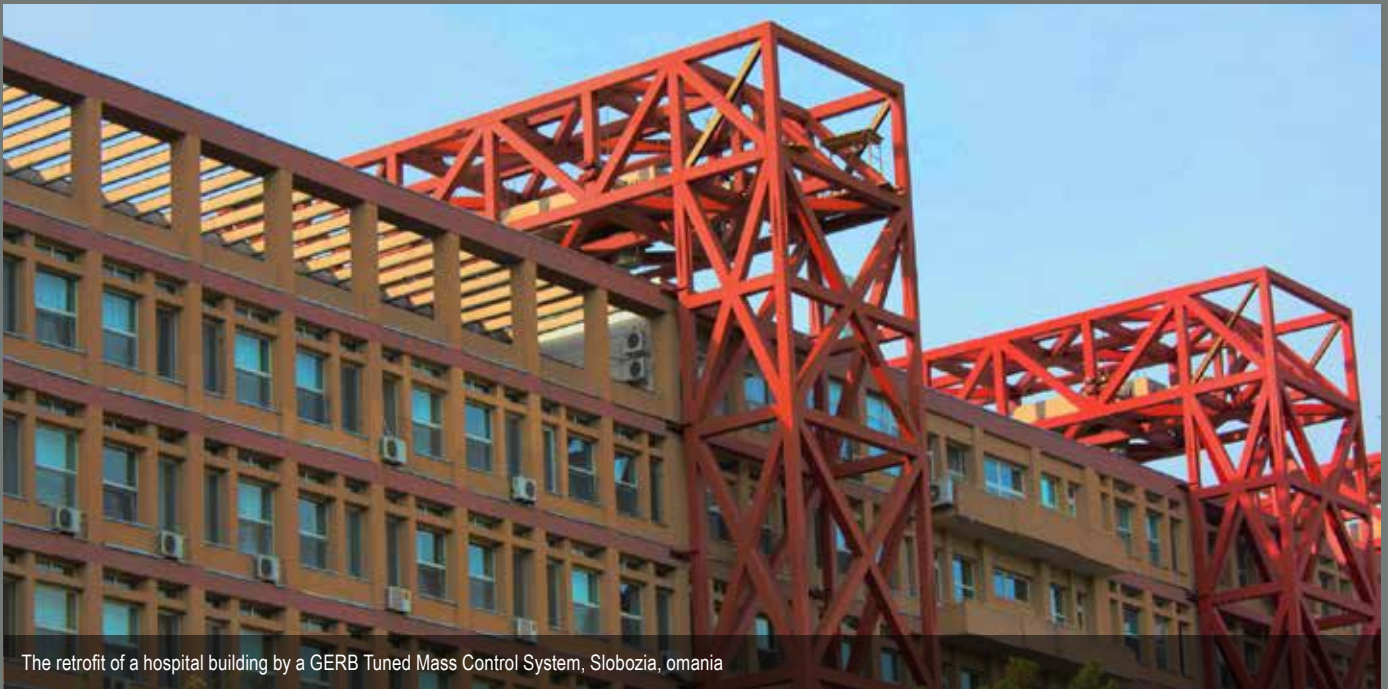
The retrofit of a hospital building by a GERB Tuned Mass Control System, Slobozia, omania