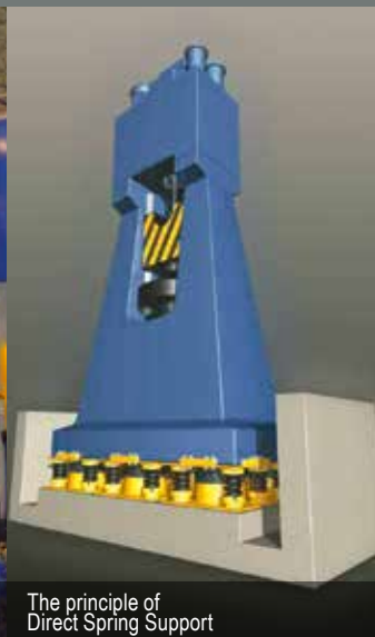
The principle of Direct Spring Support