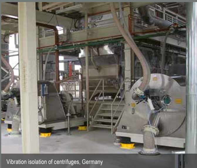
Vibration isolation of centrifuges, Germany

Throughout the world, GERB has succeeded in isolating the largest and most complicated presses in a very effective manner.