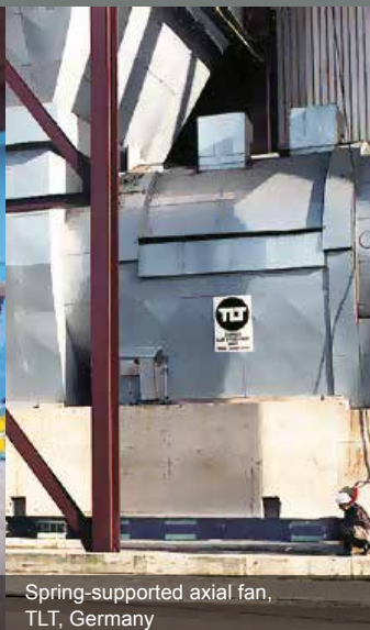
Spring-supported axial fan, TLT, Germany