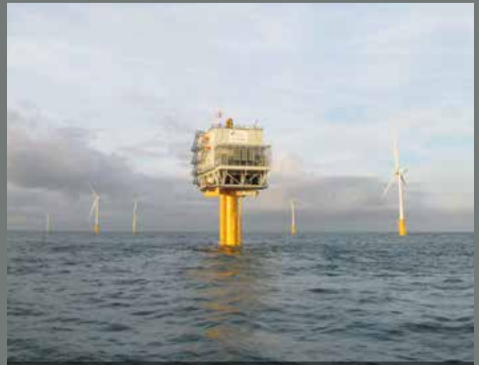
An offshore tower with TMD, North Sea