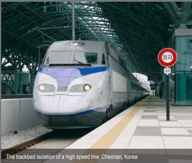
The trackbed isolation of a high speed line, Cheonan, Korea

The vibration and structure-borne noise isolation of concert halls, TV studios, nightclubs, IT rooms, swimming pools and even helipad platforms are just a selection of examples of projects that GERB executes on a daily basis.