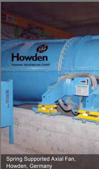
Spring Supported Axial Fan, Howden, Germany

Spring support not only reduces maintenance costs as a result of less wear and tear, but also allows for smaller foundations that eliminate layout constraint at the site.