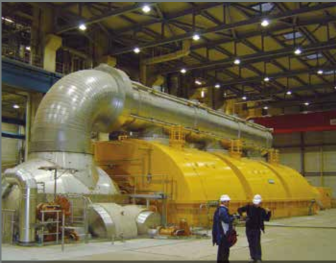
The spring-supported 900 MW Siemens turbine, Germany