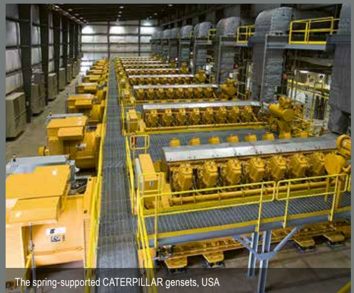
The spring-supported CATERPILLAR gensets, USA

Our 4 point isolation system has replaced the standard type 3 point supporting systems on a global level.