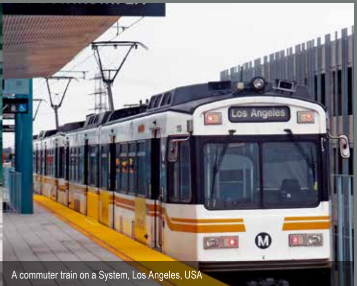
A commuter train on a System, Los Angeles, USA