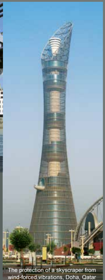
The protection of a skyscraper from wind-forced vibrations, Doha, Qatar

Wide span structures like bridges, stairs and roofs, as well as tall, narrow structures such as chimneys, antennas, masts and skyscrapers, can be excited to vibrate by wind forces, pedestrians, car or railway traffic and earthquakes. GERB's TMDs are specially designed to reduce these vibrations of heavy structures and for the required application.