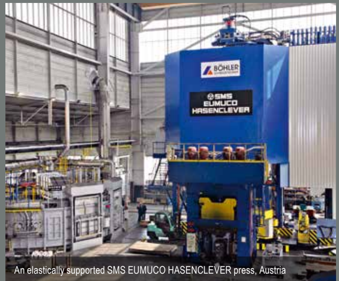
An elastically supported SMS EUMUCO HASENCLEVER press, Austria