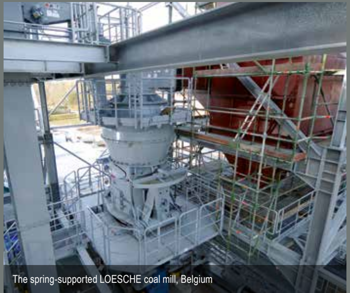
The spring-supported LOESCHE coal mill, Belgium

Spring supported condensers enable thermal expansion without any restrictions.