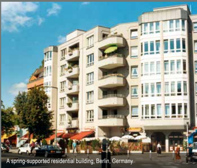
A spring-supported residential building, Berlin, Germany