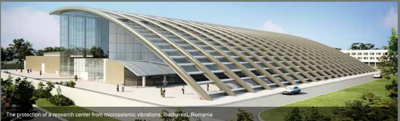
The protection of a research center from microseismic vibrations, Bucharest, Romania