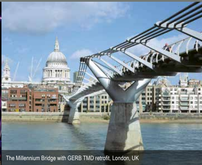
The Millennium Bridge with GERB TMD retrofit, London, UK