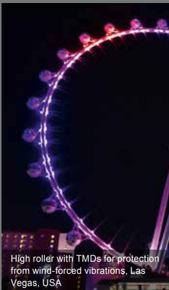
High roller with TMDs for protection from wind-forced vibrations, Las Vegas, USA

With so-called Tuned Mass Control Systems, GERB has been able to effectively protect large bridges, new and existing sensitive buildings such as hospitals and office buildings. For further information please do not hesitate to contact us.