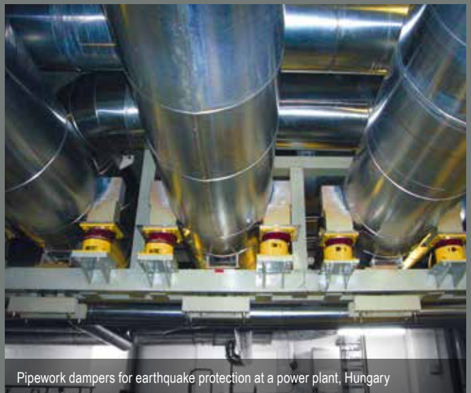
Pipework dampers for earthquake protection at a power plant, Hungary

The efficiency of vibration isolation of more than 95% will not cause any disturbance to the surrounding area. Furthermore, the low total weight of the spring supported fan protects from settlement of the substructure .