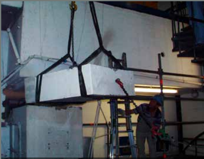
Retrofit of a turbine foundation system at a power plant, Germany