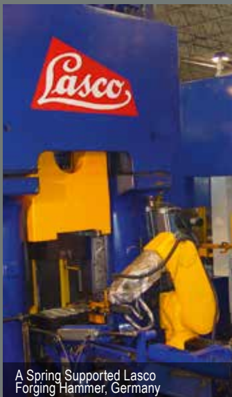
A Spring Supported Lasco Forging Hammer, Germany